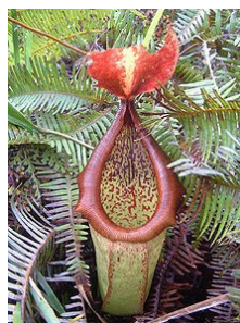
A pitcher of Nepenthes insignis from New Guinea